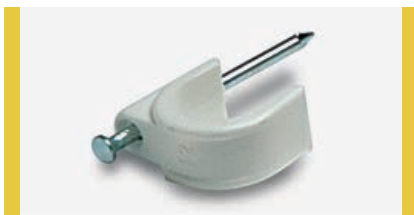
Grapillón de plástico con clavo de acero templado. Plastic staples with tempered steel nails.

Caja dispensadora grapillones de plástico Display box for plastic staples